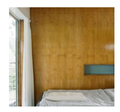
Edition 5+2 AP, Price include passepartout and frame "Thilo Schoder, Textilfabrik Gera VI, 2017", 30 x 40 cm, C-Print: 2000 € "Thilo Schoder, Frauenklinik Gera II, 2017", 40 x 30 cm, C-Print: 2000 € "Hans Scharoun, Haus Schminke III, Löbau, 2017", 80 x 80 cm, C-Print: 5500 €