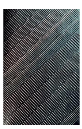
Edition 10 + 4 AP, Price include passepartout Ditone prints ca. 24 x 18 cm: from 1.500 € Ditone prints ca. 38 x 28 cm: from 2.500 €