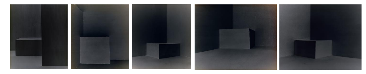
Edition 7 + 2 AP, Price include frame

Works from the "Aérolithiques" cycle will be on display. These works entered recently the collection of the Bibliothèque Nationale de France.